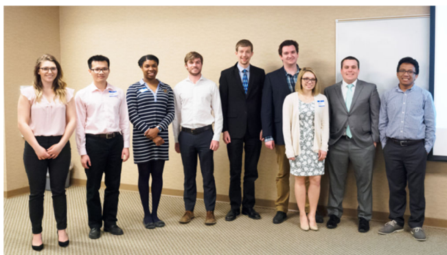
2018 YIS Participants

We invite all GLC members and friends to join us for the annual Young Investigators Symposium to encourage and promote promising student research.